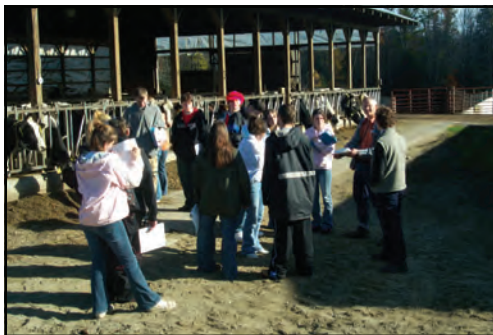
The Stream Team recently visited the Thomas Farms of Garland.

Partners in this work include: Penobscot County Soil and Water Conservation District, Penobscot Indian Nation, Maine Department of Environmental Protection, University of Maine, Maine Atlantic Salmon Commission, and the Northeast Field Office of the Fisheries Division of the National Oceanic and Atmospheric Administration.